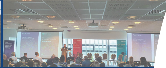
Social Mobility Conference