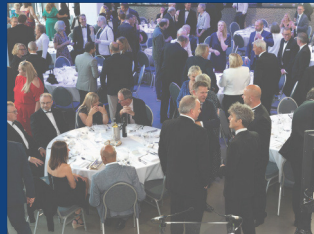
Our Annual Dinner