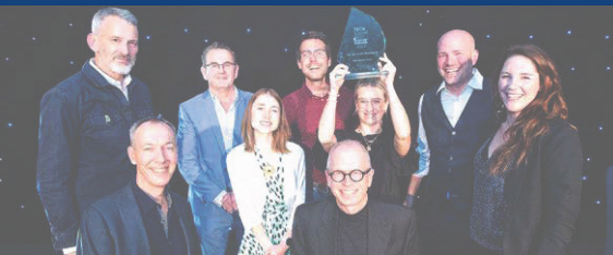
Tech South West Awards