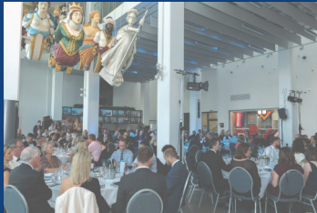
Our Annual Dinner