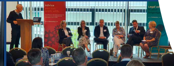
SWBC Social Mobility Conference