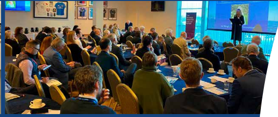
Energy Transition Conference