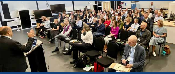
Natural Capital Conference