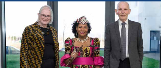
Queen Diambi Appointment